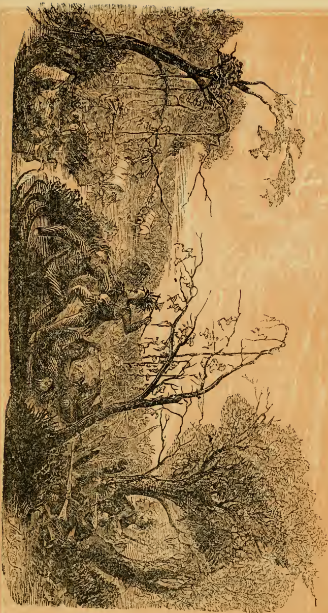
MASSACRE OF THE WHITES NEAR DELRVILLE.